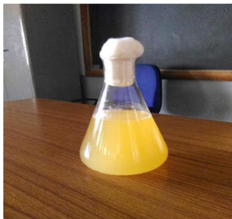
Figure 2 Solution without CaCO_3

Confirmation for bacterial growth is done if after incubation period the solution becomes turbid as shown below.