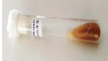
Figure 1 Slant culture of Sporosarcina pasteurii

Based on past research, Calcium lactate of 5% weight of cement is added to mortar to provide long term calcium supplement for bacterial activity.