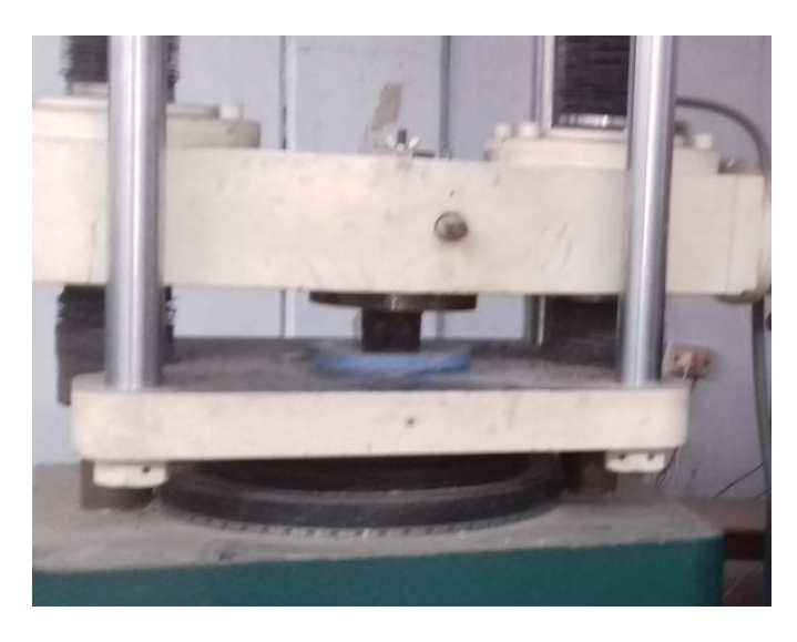
Figure 1 Compressive strength testing

The compressive strength was determined by using Universal Testing Machine (UTM) as shown in Figure 1. The specimen was kept between the compressive plates and gradually load was applied till the failure of the specimen occurred and thus the compressive strength of the specimen was found.