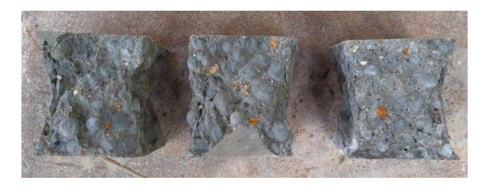
ii) concrete with artificial aggregates