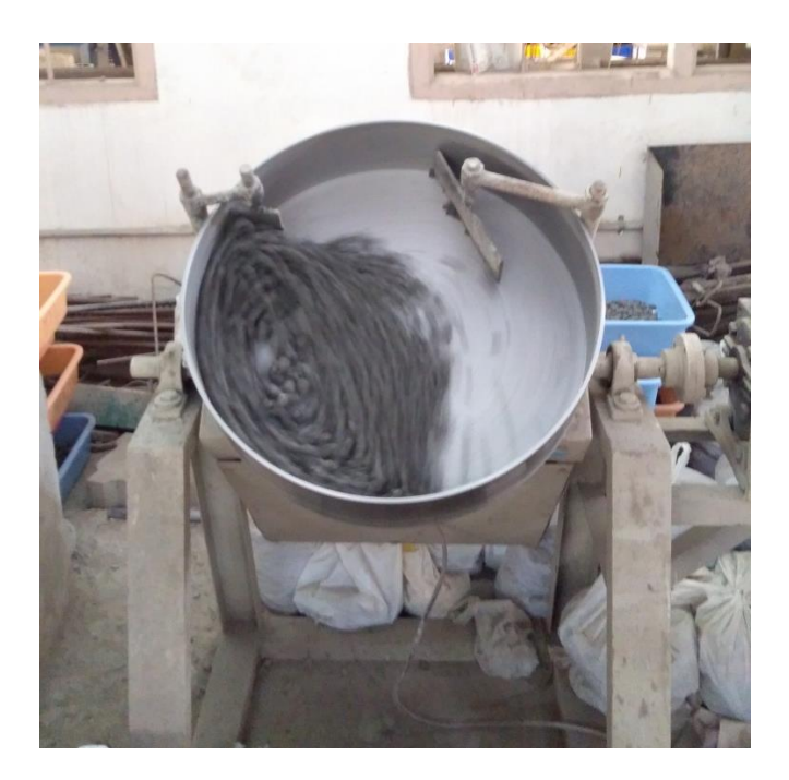
Figure 1 Laboratory scale disc pelletizer.

ii) Alkali solution was sprayed within three minutes to the fly ash during the process of pelletization.