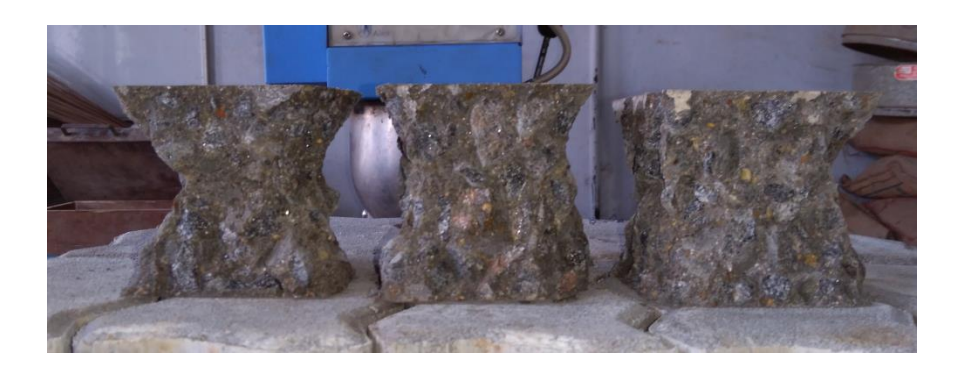
i) concrete with natural aggregates